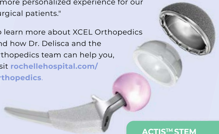
ACTIS™ STEM HIP IMPLANT